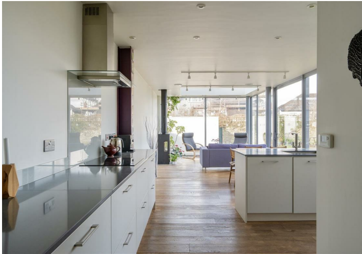
131 Stanwell Road